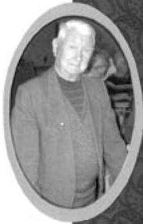
Cyril W. Bull Foundation's Progenitor (1981)