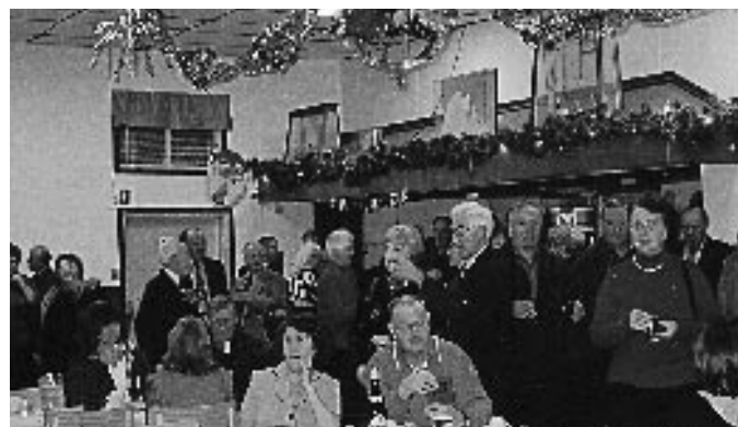
Socializing before the dinner at the Con-Tri Christmas Party, November 29, 2005.