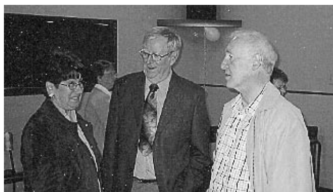
Members of Burin Division socializing at the Lawn Spring Banquet.