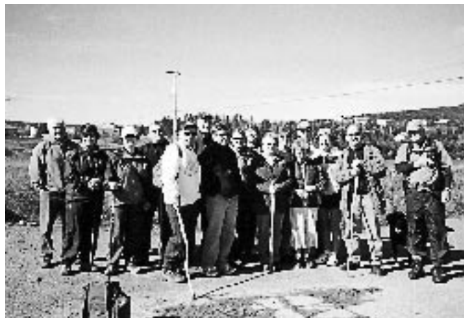
Sixteen members of AE hiked the Mickleen Path from Witless Bay to Bay Bulls.