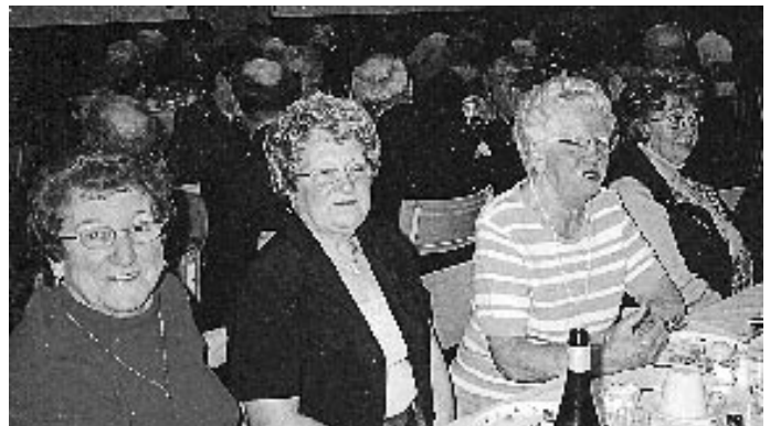
Con-Tri members enjoying the fellowship at the May/05 Spring Banquet.