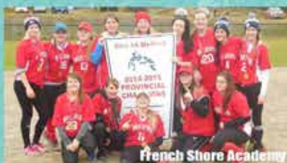
French Shore Academy

208 Tournaments 8180 Athletes 200+ Sportsmanship Awards 243 Scholar Athletes