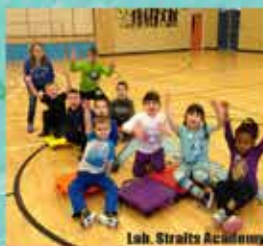
Luk. Straits Academy