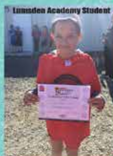
Lumsden Academy Student

280 Events 20,555 Event Participants 1422 Active Hours 46 Different Sports & Activities Played