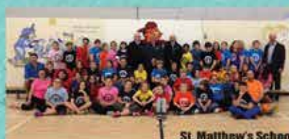
St. Matthew's School