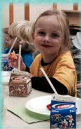
Making Nutrition Matter!

208 Tournaments 8180 Athletes 200+ Sportsmanship Awards 243 Scholar Athletes