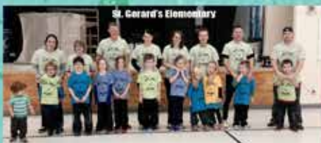
St. Gerard's Elementary

14 Sites 194 Student Participants 165 Parent/Guardian Participants