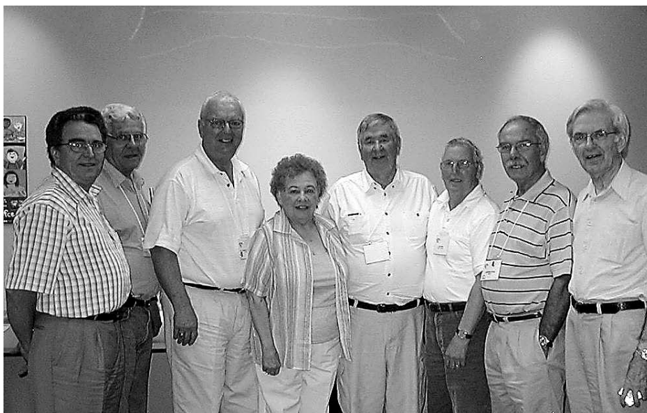
Directors and Alternates from Atlantic Region at June 2006 ACER-CART AGM

Next ACER-CART AGM: June 1-2, 2007, in Ottawa.