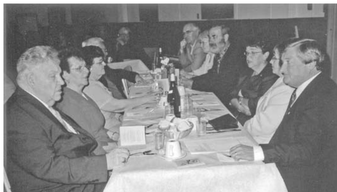
Trinity Bay members enjoyed the May banquet.

In the Spring, we did a survey of some of our members to get their opinions on new events and outings. The results of the survey are being tabulated, so members are reminded to check the local