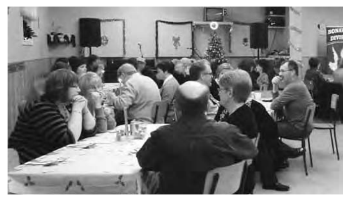
Christmas Dinner at King's Cove