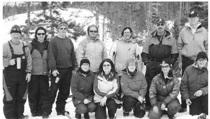
Annual winter hike at Princeton Pond.