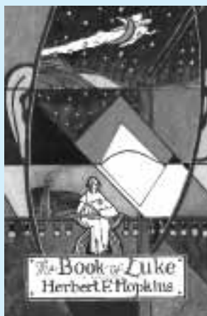
Illustrations and Cover design – B.W. Chubbs

Show the world you care about ending elder abuse and neglect by wearing something purple on June 15, 2011 as we observe the 6th annual World Elder Abuse Awareness Day (WEAAD).