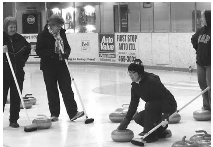
A curling session at the Bonavista Stadium.