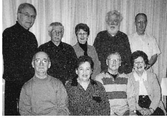
RTANL Provincial Executive 2004-06

Apart from the fact that winter has never been one of my favourite seasons, there is another