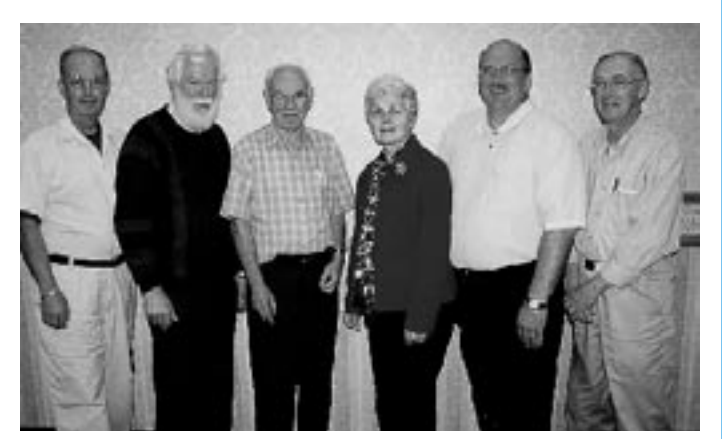
RTANL Central Executive 2005-06

Our 2004-05 year activities concluded on May 22/05 with a meeting at the Mount Peyton Hotel in Grand Falls-Windsor. The Provincial Executive joined us