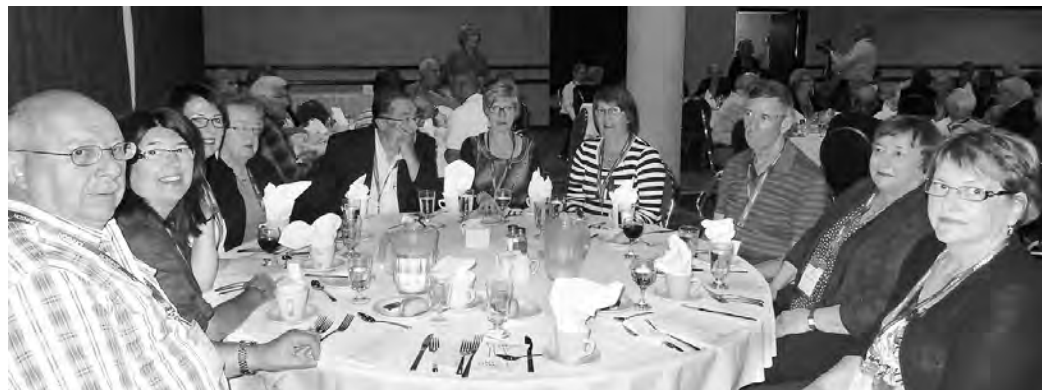
Bonavista Division delegates at BGM 2014 in Corner Brook.

Seven of our members and two spouses attended the BGM and Reunion in Corner Brook from September 30 to October 2. Informative business meetings were complemented by delicious meals, entertainment, and dancing. Mother Nature treated us to perfect weather