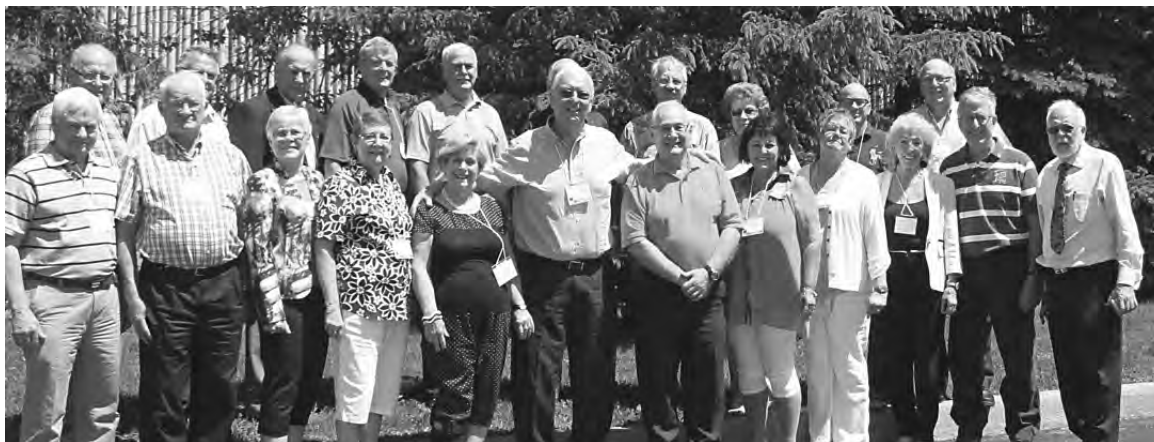
Executive, Directors and Observers at the 2014 AGM.