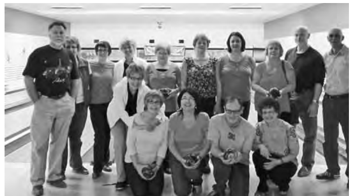
Members of Bonavista Division enjoy a game of bowling at Caribou Lanes in Clarendville.