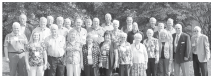
ACER-CART representatives at AGM in Ottawa.