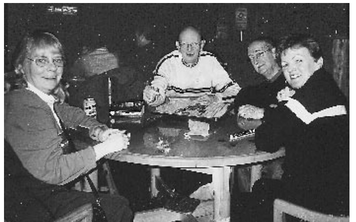
Board Games at Annual Fun Day Retired teachers enjoy a board game at the annual February Fun Day.

On June 6/03, our Annual Dinner and Dance was held at St. Teresa's Parish Hall. Over 140 retired teachers and guests enjoyed a delicious turkey dinner. The entertainment by "Accent", a Barbershop Quartette,