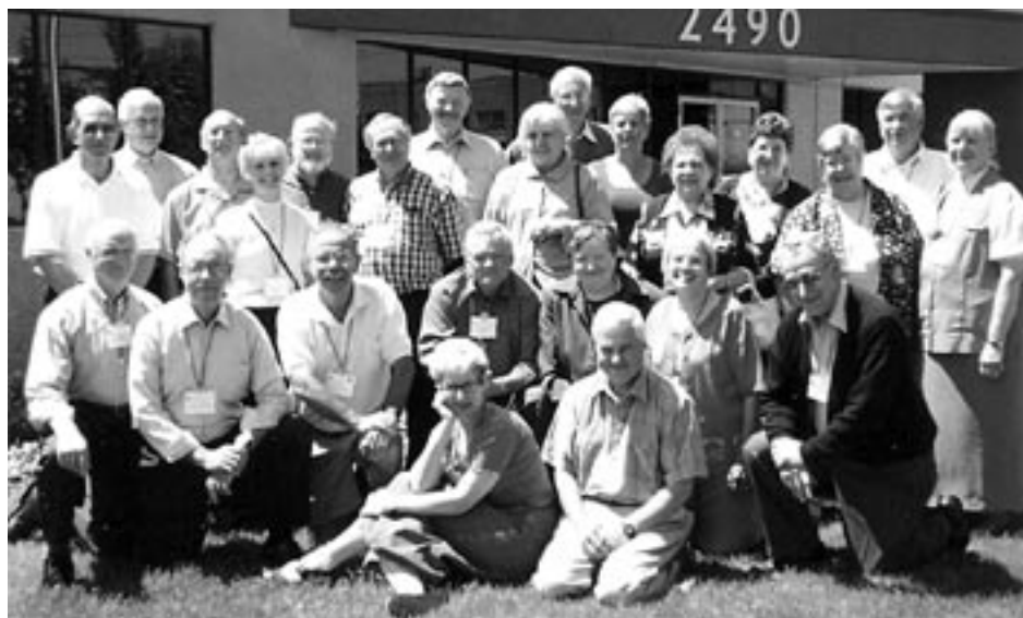
ACER/CART BOARD OF DIRECTORS & Observers at June 2003 AGM in Ottawa.