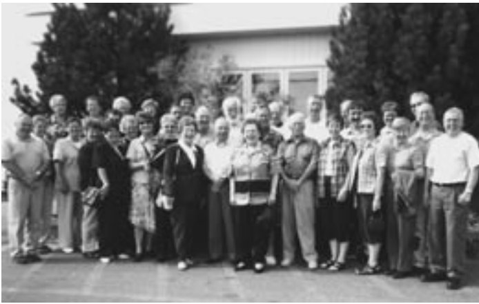
Provincial Executive with Members of Burin Division outside Wong's Palace Restaurant in Marystown, September 27/03.