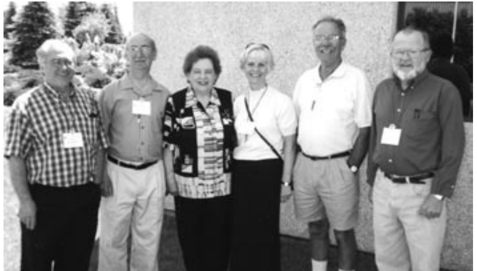
ACER/CART DIRECTORS from Atlantic Provinces.