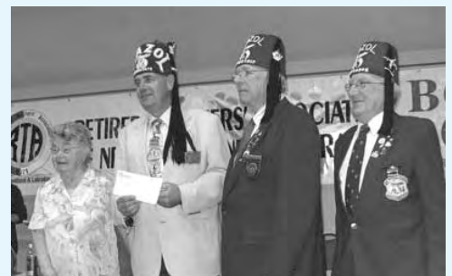
Shriners Accept Donation From RTF