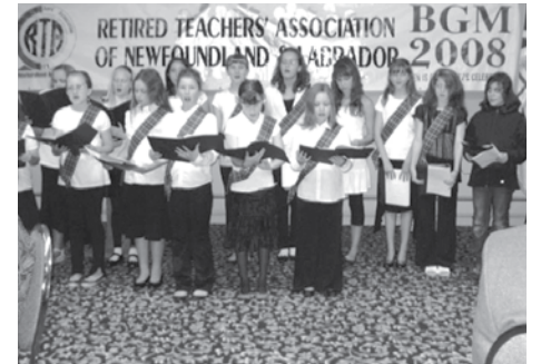
C.C. Loughlin School Choir Performs.