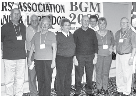
Members from Con-Tri.