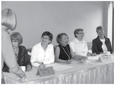
Registration BGM 2008.