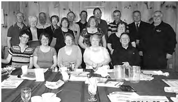
Members at the annual spring meeting in May 2014.