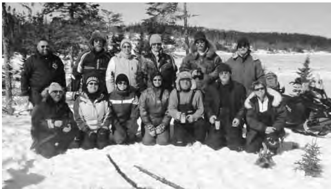
Members and spouses enjoy a winter outing on March 18.