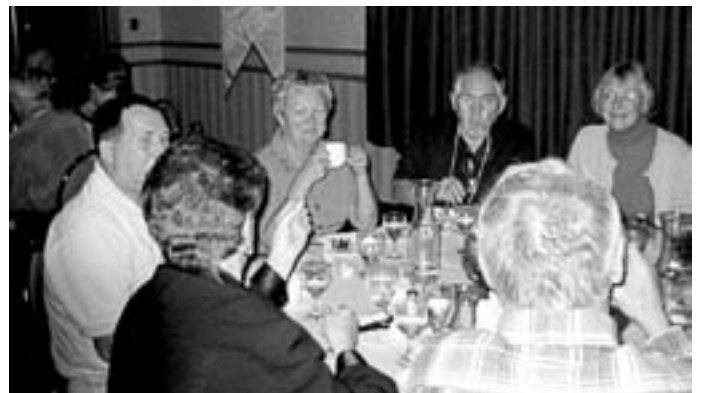
Enjoying the first evening meal at Reunion 2004