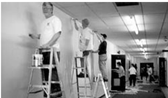
Labrador West Regional retired teachers painting the Heritage Wing Corridor at JRS Middle School, Wabush