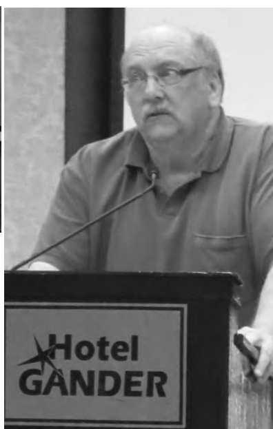
The Boss Speaks