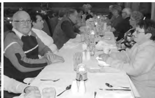
January Dinner at Sinbad's