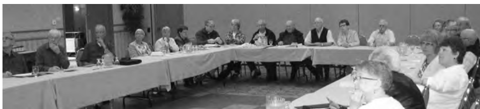
Meeting in Session