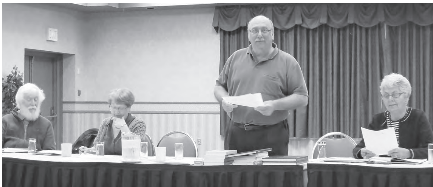
Executive in Action