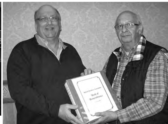
Presentation of Volume 3 Remembrance Book