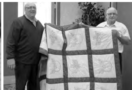
Quilt Donated for Foundation