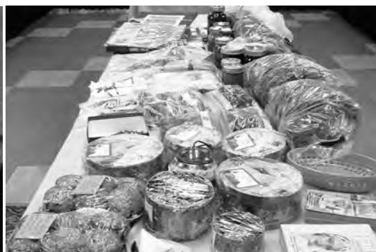
Auction - Baked Goods