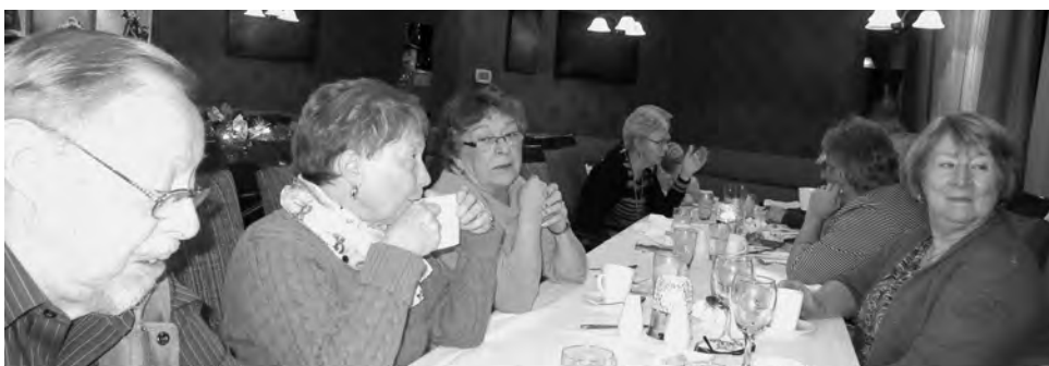
January Dinner at Sinbad's