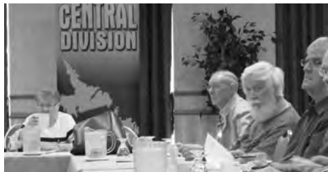
Meeting in Session