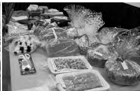
Auction - More Baked Goods