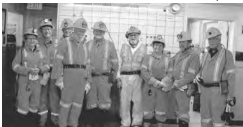
Visit to Duck Pond Mine Facility