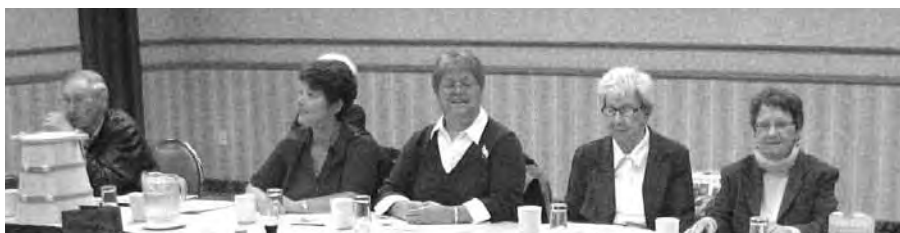
Attending a Meeting