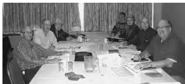
Executive at Work