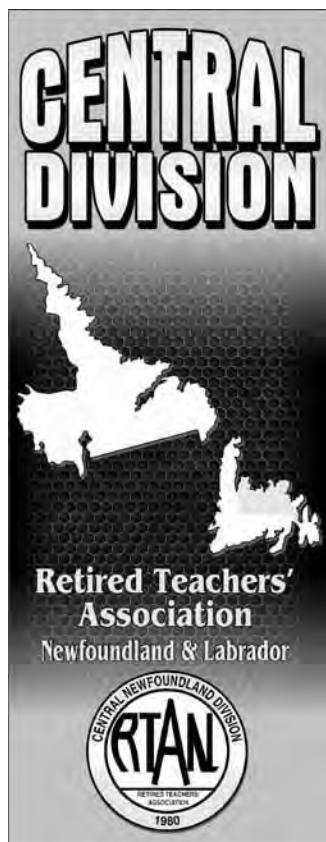
Our New Banner