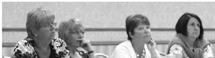
Attending a Meeting