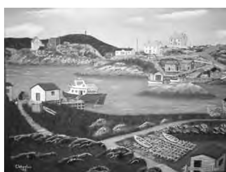
Change Islands – On Tickets