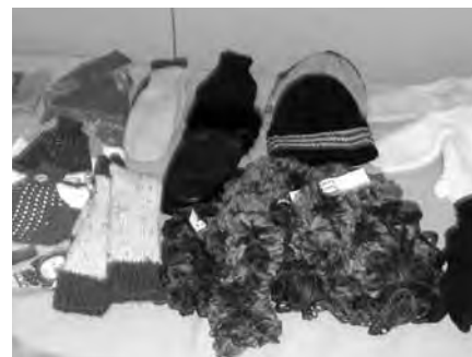
Auction - Knitted Goods