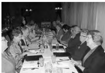
Dinner at Sinbad's