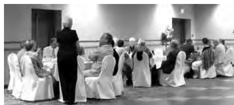
Banquet in June