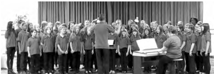
Gander Academy Choir