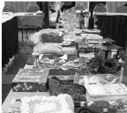
Auction - Knitted Goods