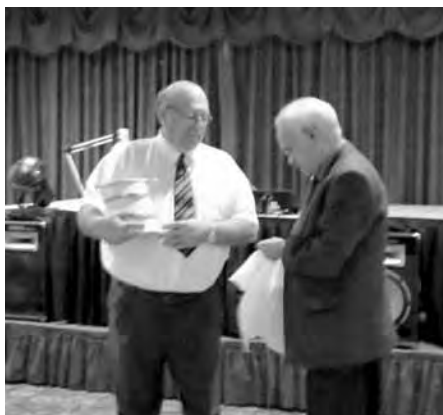
Fisherman's Basket Draw