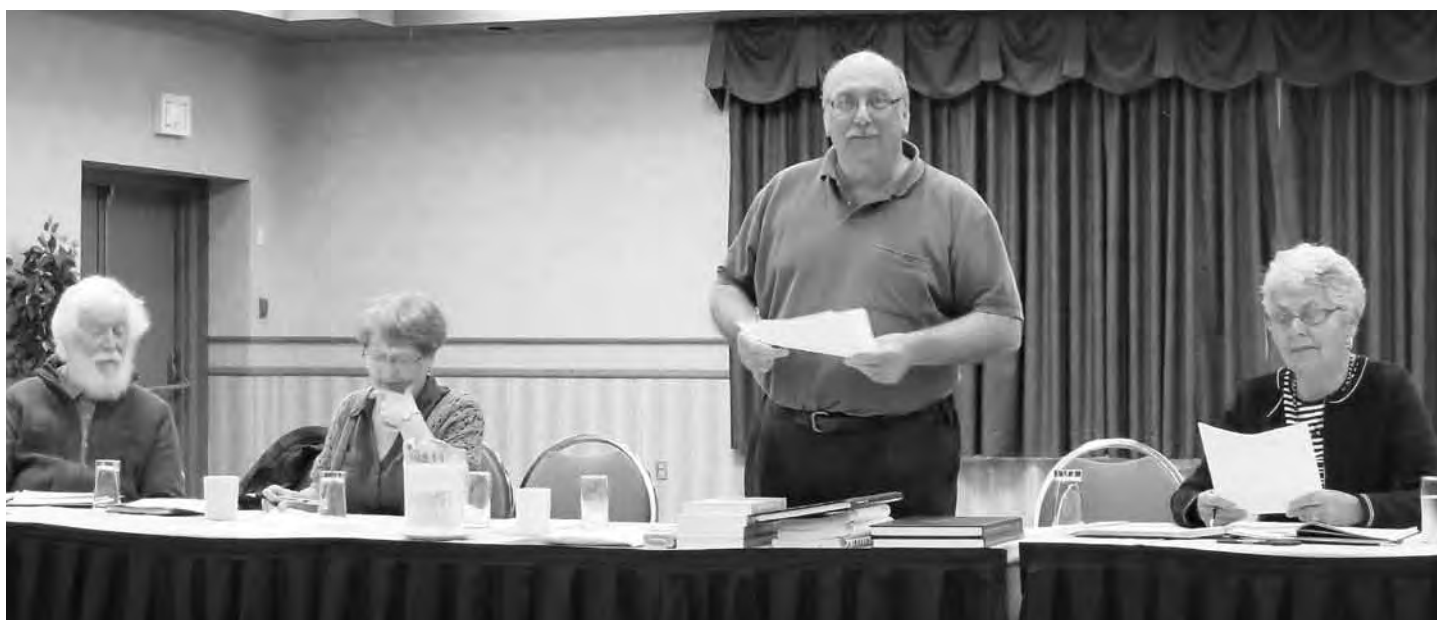
Executive in Action