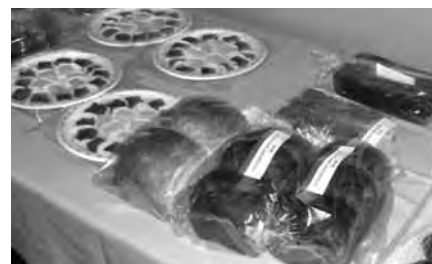
Auction - Baked Goods